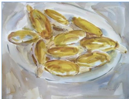
Two Thirds Limit