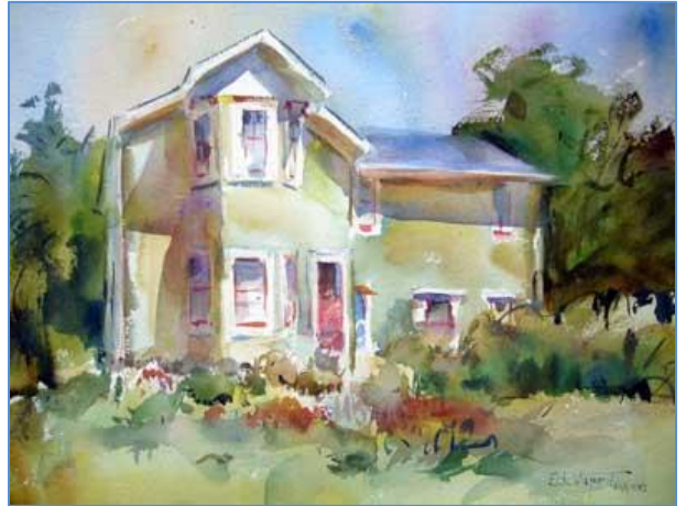
Wiegardt Studio Gallery