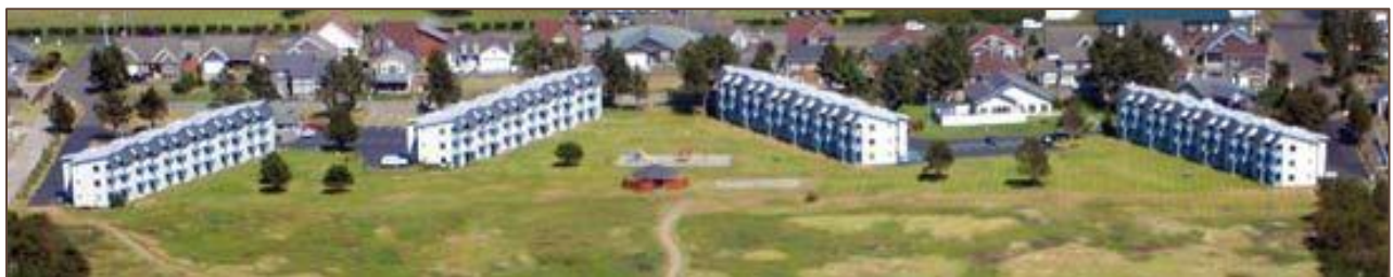
More about Eric Wiegardt go to www.ericwiegardt.com

LOCATION OF WORKSHOPS: Pacific Hwy 101, a mile north of Long Beach on the ocean side. Google map link: www.breakerslongbeach.com/getting-here/